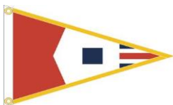
Beaufort Sail & Power Squadron

Thank you for your consideration of becoming a 2017 Light Up the Night sponsor.